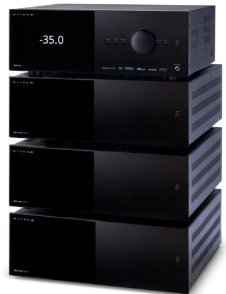
Three MCA 525s (Gen. 2) paired with an AVM 90 A/V Processor

Create Your Own Dolby Atmos 15-Channel System