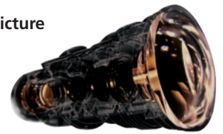
High-quality 65 mm diameter, 17-element, 15-group all glass lens

The DLA-NP5 is equipped with a 65mm diameter, high resolution, 17 element, 15 group all glass lens to deliver 4K resolution on the screen. For excellent installation flexibility, a wide shift range of +/-80% vertical, +/-34% horizontal is offered.