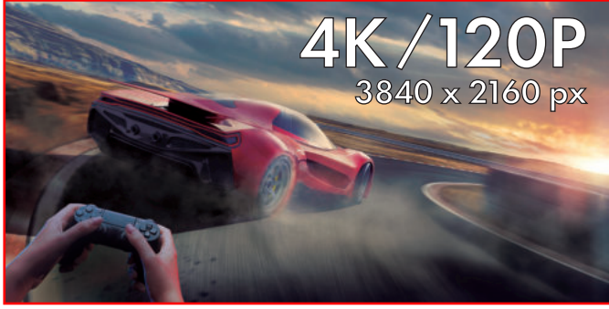
From Blu-ray and gaming consoles to 4K streaming services, native 4K content can be enjoyed to its fullest on JVC D-ILA projectors without conducting any upscaling process.

The DLA-NP5 offers dual 48Gbps HDMI inputs with HDCP 2.3. 4K/120P input is supported for the newest generation video content, including the latest gaming platforms.