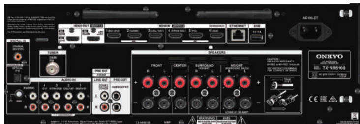
Text on receiver may vary with region.